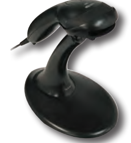
Bar Code Scanning

Up to four RS-232C communication ports hidden behind a convenient, easy to access door located on the back of the unit.